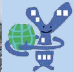
CASBEE Yokohama image character "Casbippi"