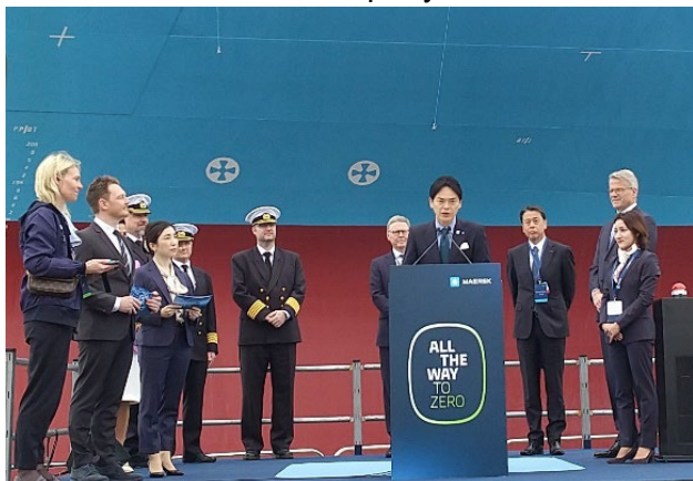
Mayor Yamanaka gives a welcoming speech.